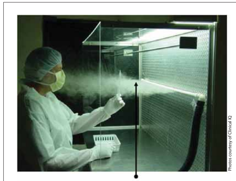
A smoke simulation demonstrates the first air zone.

Aseptic technique can be defined as a set of specific work practices and procedures performed under carefully controlled conditions with the goal of minimizing the introduction of contamination. USP Chapter <797> emphasizes the important role that compounding personnel play—especially through aseptic technique or how they use their hands—in preventing inadvertent contamination of CSPs during preparation. The introduction to Chapter <797> states, “It is generally acknowledged that direct or physical contact of critical sites (e.g., vial septa,